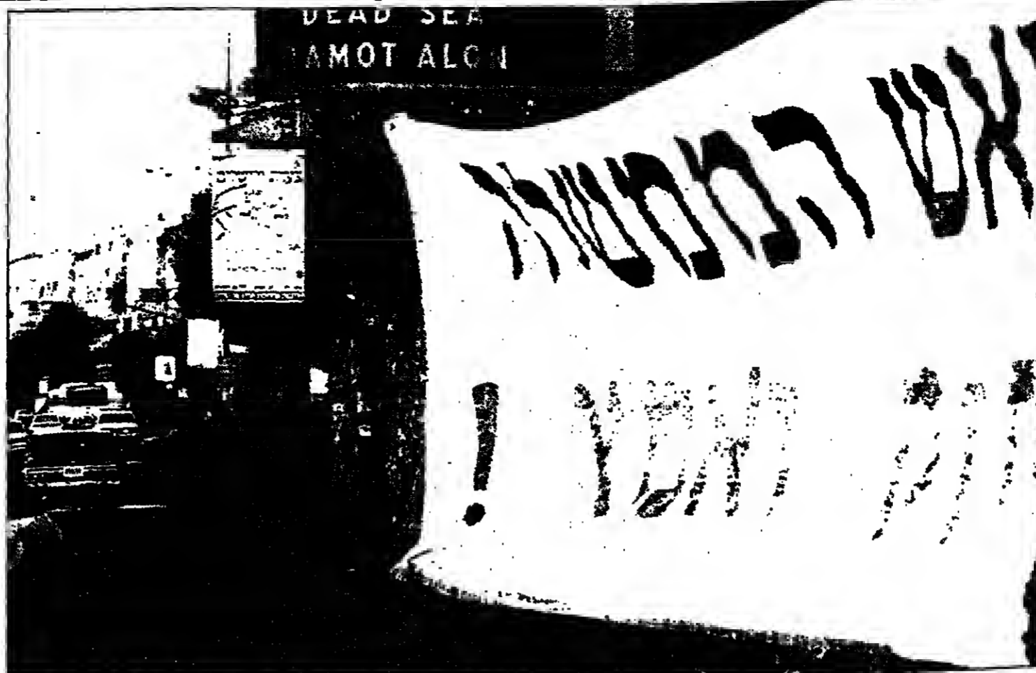
Signs supporting a "strong and courageous" Prime Minister Binyamin Netanyahu were hung on the Tel Aviv-Jerusalem Highway yesterday as Netanyahu left for the airport on his way to Washington.

that the Palestinian Authority control its forces. "To create this unrest, including the shoot-out with the police, is a grave breach of the agreement and the results have been tragic," Levy said, adding that "Israel will never agree to a situation in which its partners in peace regard opening fire as a means to sort out problems." Levy also assailed as unbalanced the resolution, passed on Saturday by the UN Security Council, which indirectly called on Israel to close the Hasmonean Tunnel. The resolution also did not specifically mention Israeli casualties. The council's vote was 14-0, with the United States abstaining. "We suddenly find ourselves in a situation where, with each move we make in Jerusalem, it is suddenly claimed that it is illegal," he said. "Whoever asks, 'Why did you open this tunnel?' is really asking: 'Why do you think Jerusalem is yours?'" Levy, who was to travel to Washington yesterday for the summit, was due back in New York on Thursday to address the UN General Assembly.